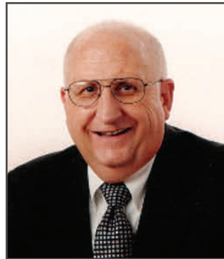
WESTERN SARE COORDINATOR'S COLUMN